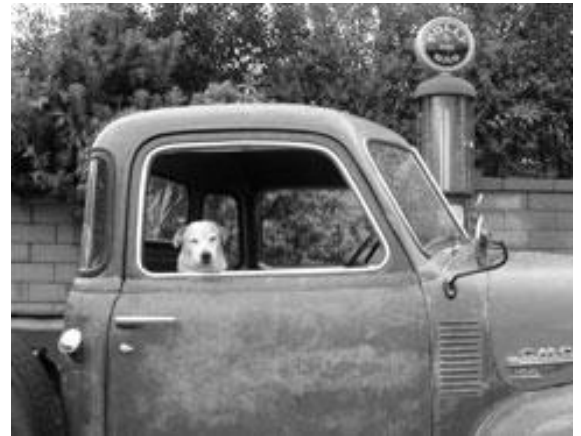
Sparky-the Perfect Pet

Do you have a perfect pet? Show off your best friends with your special picture! Send us your pets *photo along with a $25.00 donation and we will post it on our website! Some will even make it into our newsletter. Send or email a 3x5 black & white or color photo, along with your pet's name as you want it listed on the website. Your $25.00 donation (per photo) will make your pet a celebrity!! All donations will help us continue to save animals through our Animal Rescue Fund program and provide spay and neuter vouchers for low income and senior citizens. Please make checks payable to OCSPCA . Space is limited! For questions call 714-374-7738.